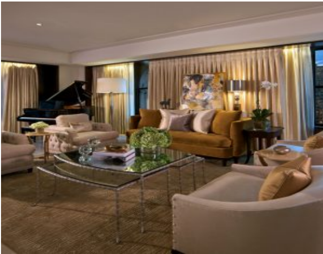
The Peninsula Suite Living Room