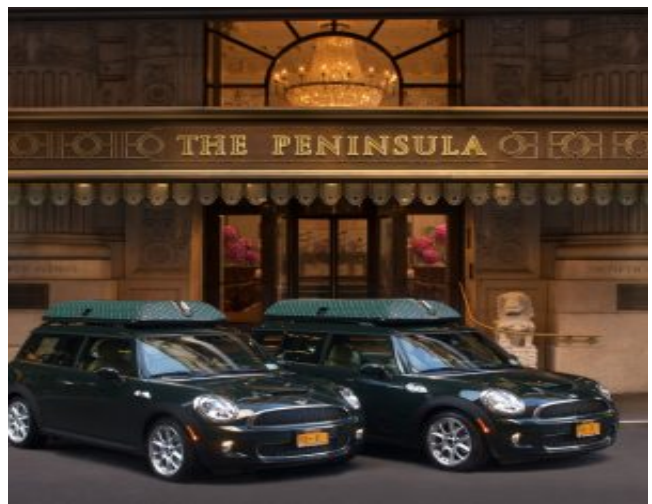
Entrance and liveried MINI Cooper fleet