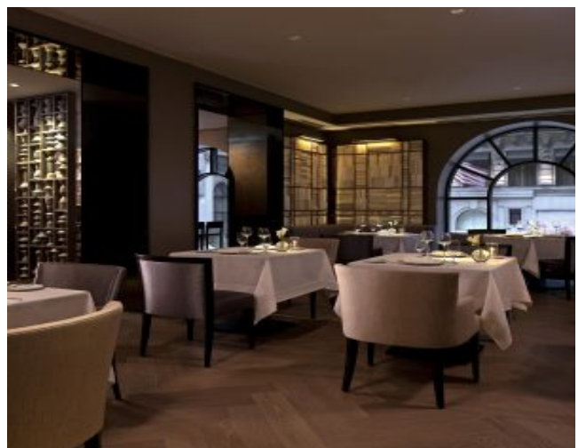
Clement Restaurant- Book Room