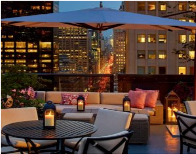
Salon de Ning rooftop bar