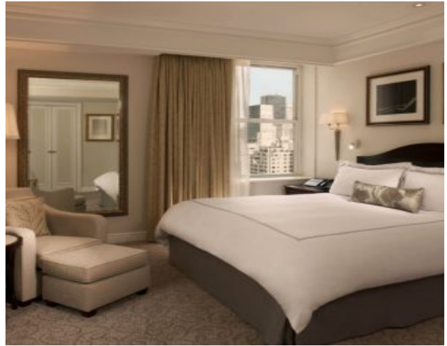
Executive Suite Bedroom