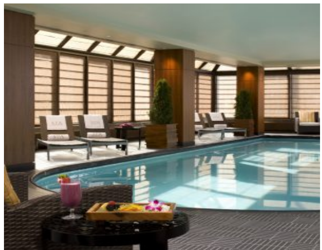
The Peninsula Spa - Swimming Pool