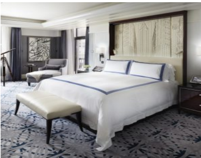
NEW Fifth Avenue Suite, bedroom