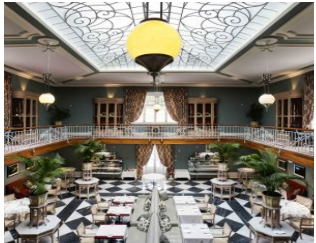
Winter Garden Restaurant