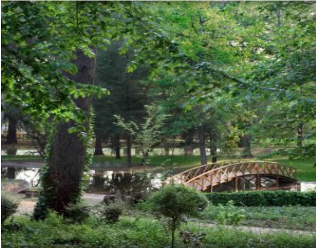
The Park and outdoor events space