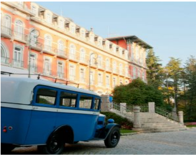
Vidago Palace Bus