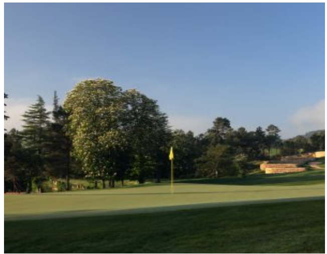
18-Hole Golf Course