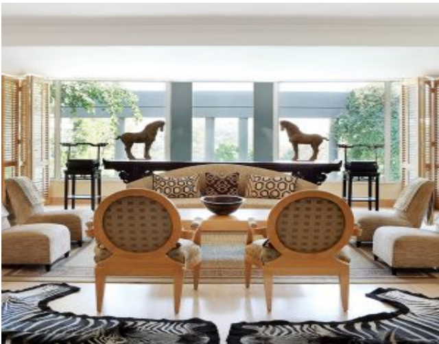
Mandela Presidential Suite