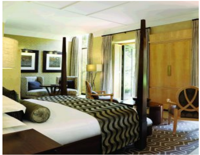
Saxon Executive Luxury Room