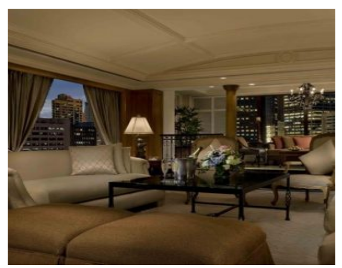
The Peninsula Suite Living Room