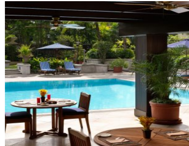
Pool Snack Bar