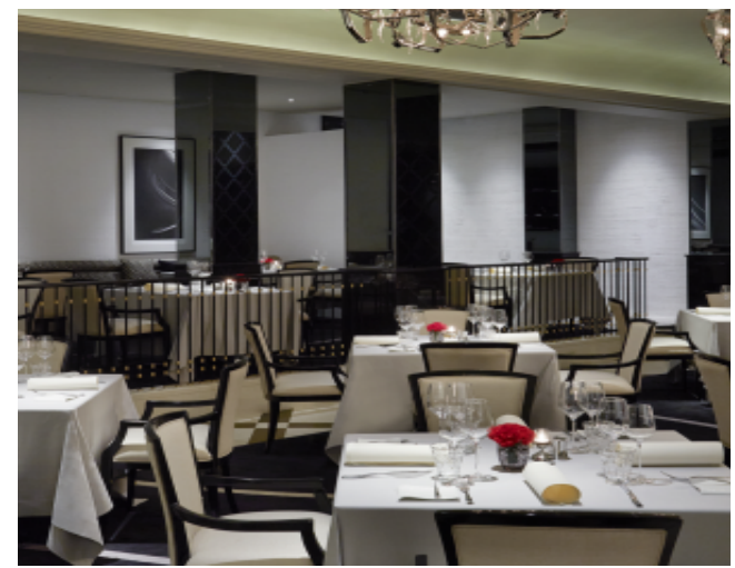
Old Manila Restaurant