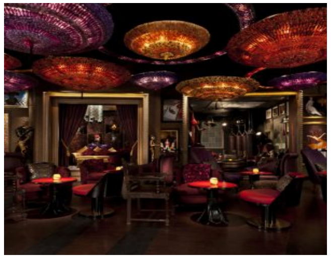
Salon de Ning Main Salon