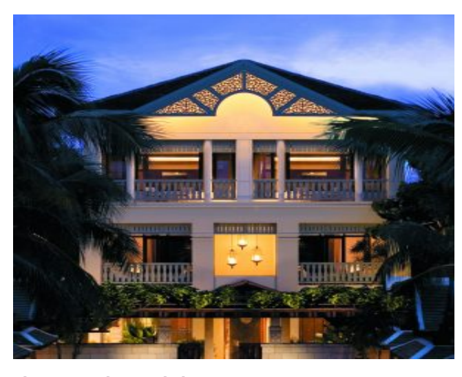
The Peninsula Bangkok SPA