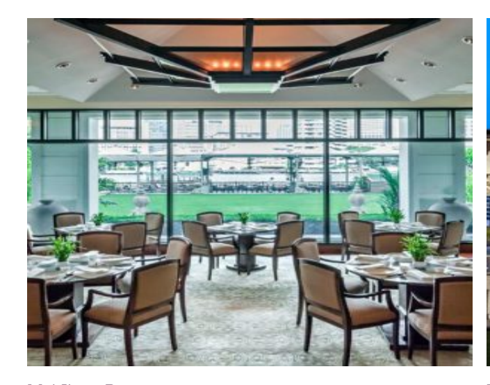
Mei Jiang Restaurant