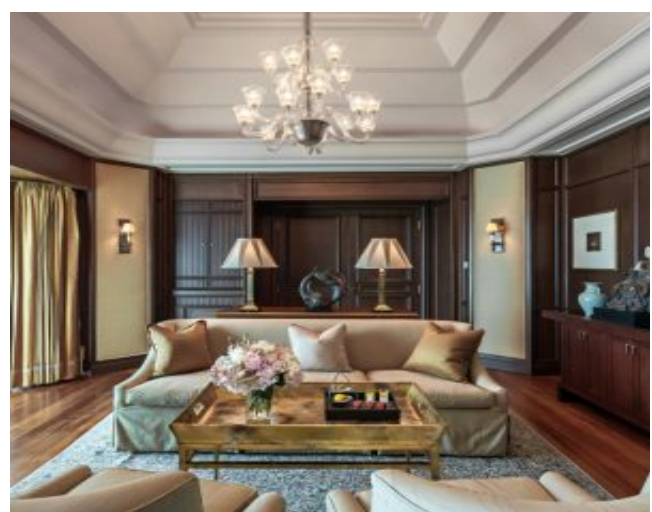
The Peninsula Suite