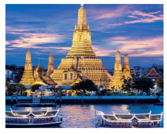
The Peninsula Bangkok boats on the river