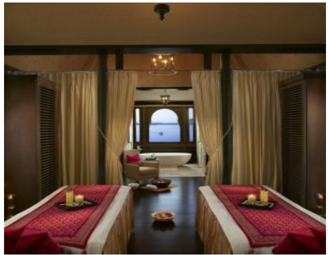
ESPA spa treatment room