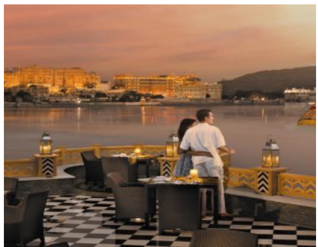
Sheesh Mahal terrace overlooking the lake