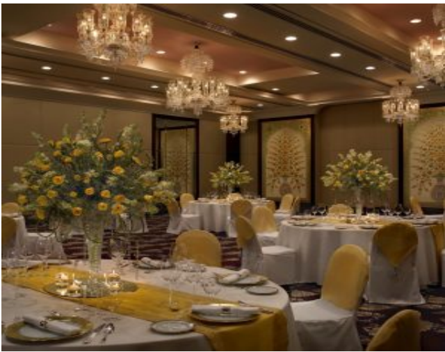
Ball Room Dinner set up