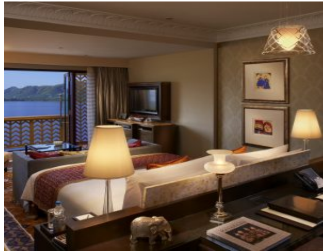
Lake View room