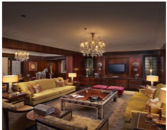
Maharaja Suite Living Room