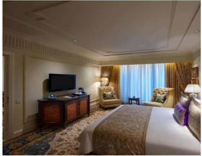
Luxury Suite Bedroom