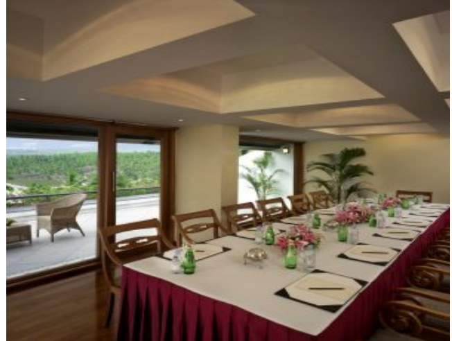
Tara Meeting Room