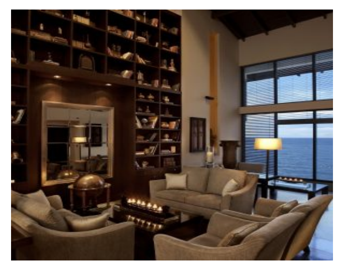
The Club Living Room