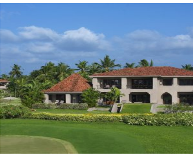
Club Exterior from Golf Course