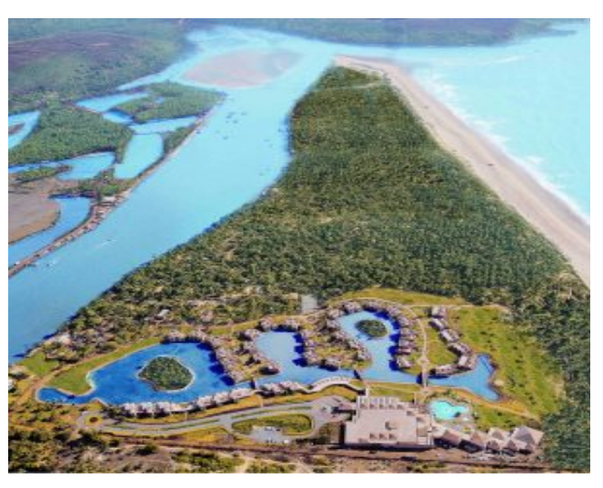
Aerial View of Property