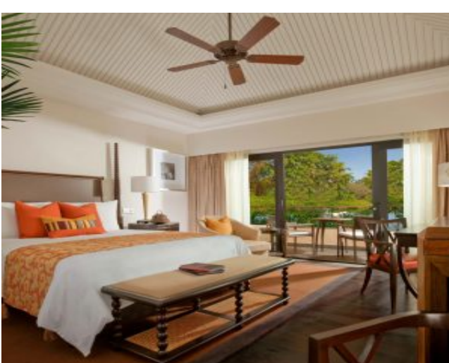
Lagoon Terrace Room