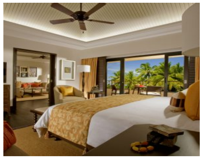
Lagoon Suite Bedroom