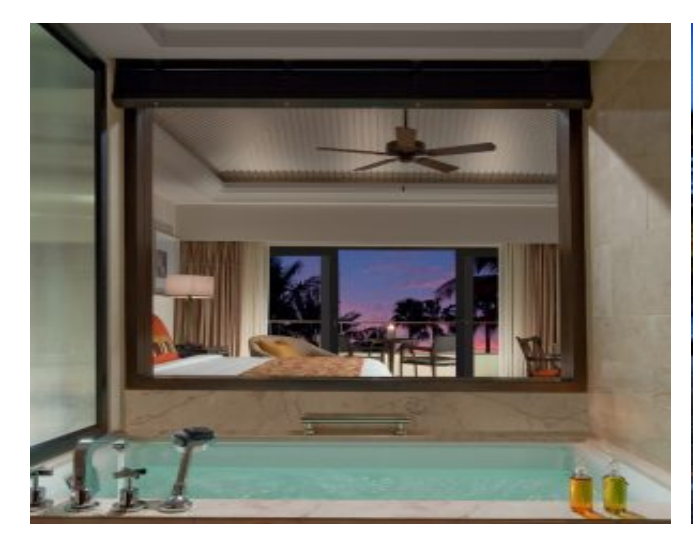
Lagoon Terrace Room - Bathroom