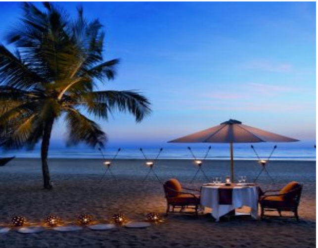
Romantic Dining on the Beach