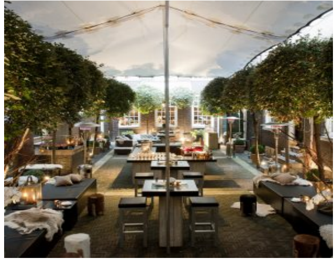
Covered secluded garden