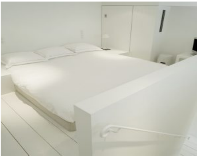
Luxury Canal View Suite - Zensation White