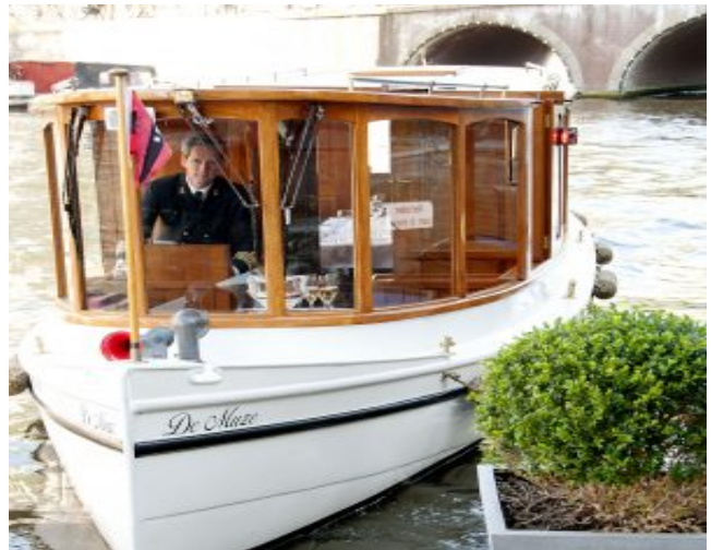
The Muze and Captain