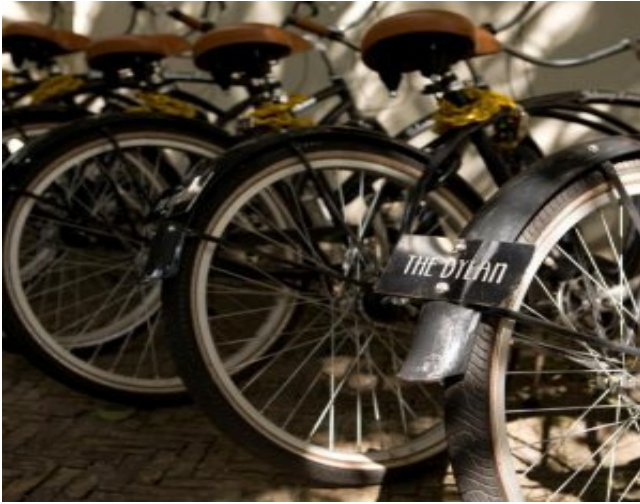
The Dylan bicycle fleet