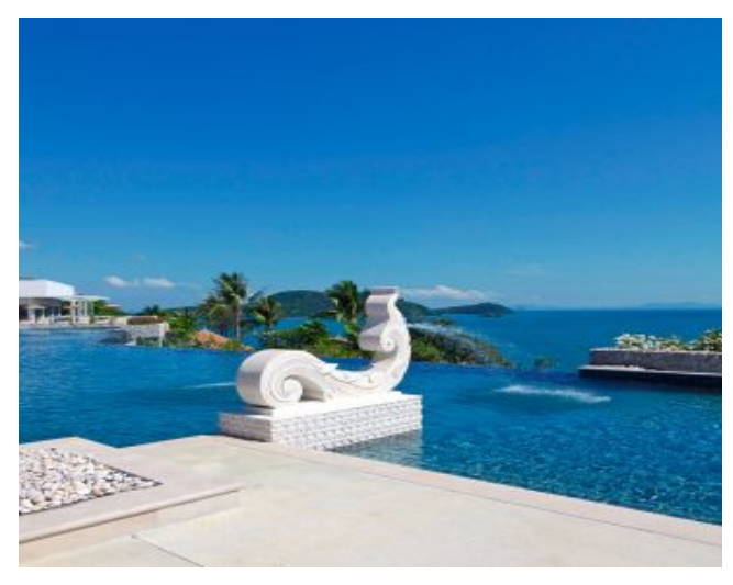
Swimming Pool Sea view Pool