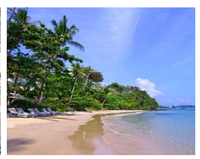
The Grill Beach