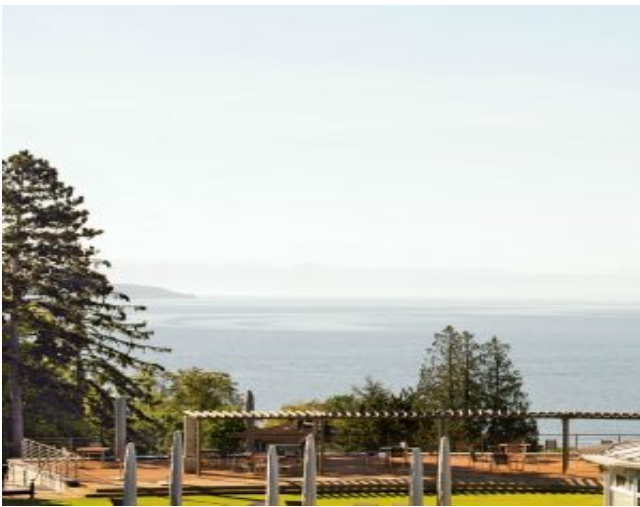
Terrasse Villa Bellevue