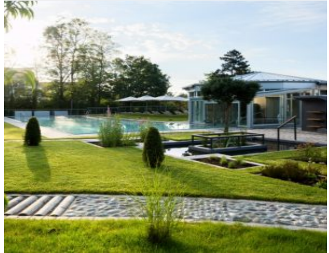
New Gardens & Swimming Pool