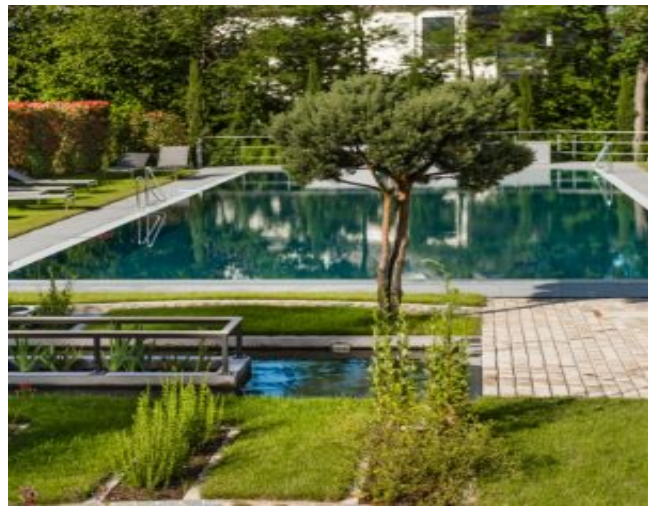
New Gardens & Swimming Pool