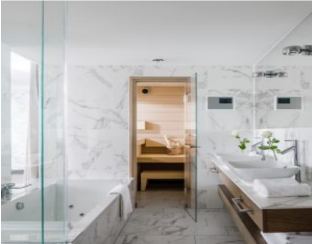
Bathroom, Villa Belgrano