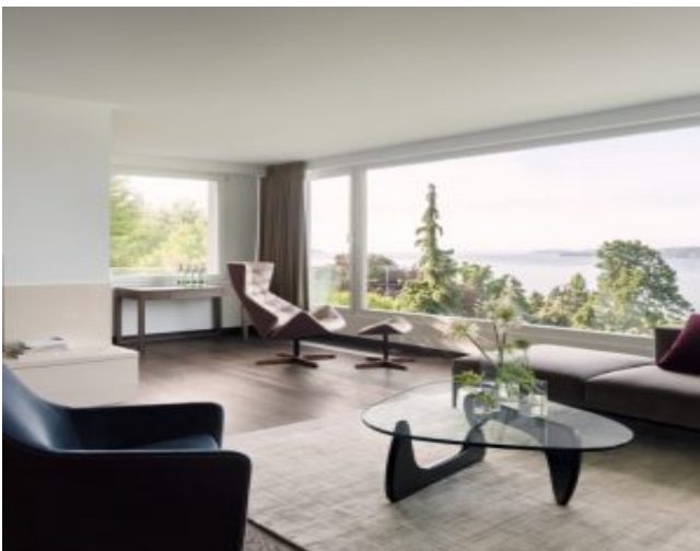
Suite Living Room, Villa Belgrano